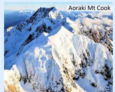
Aoraki Mt Cook

(The itinerary for this small-group tour is subject to change ... and minimum numbers are required.)